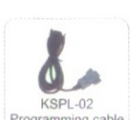
KSPL-02 Programming cable