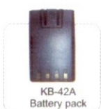
KB-42A Battery pack