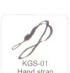
KGS-01 Hand strap