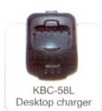
KBC-58L Desktop charger