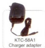
KTC-58A1 Charger adapter

The standard accessories supplied for the radio have a variety of specification options adaptable to different countries and regions.