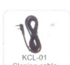
KCL-01 Cloning cable