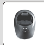
Drop-in Charger HC2100S+