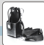
Leather carry case PT-28