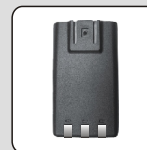
Battery TB-75(Ni-MH 1100mAh)