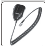
Remote Speaker Microphone SM-06