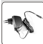
Adapter PDS-256 (230V DC 12V 300mA) Europe Standard