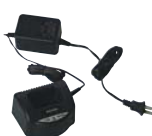
Fuzzy desktop charger for Ni-MH