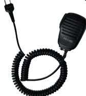
Compact Fist speaker mic