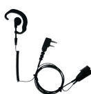
Flexible hanging speaker mic