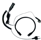
Dual throat-activated mic