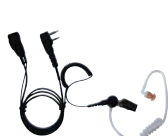
Transparent tube earphone mic