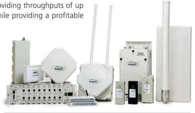
BreezeACCESS VL Family

And BreezeACCESS VL is automated at every stage of deployment and operation, smartly minimizing interference effects to establish and maintain consistently clear connections. Covering large distances with its extended coverage area and providing throughputs of up to 40 Mbps, the BreezeACCESS VL saves infrastructure costs while providing a profitable business model to broadband service providers.