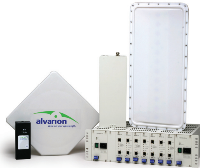
Common BreezeACCESS chassis supporting BreezeACCESS VL, BreezeACCESS 4900 and BreezeACCESS 900